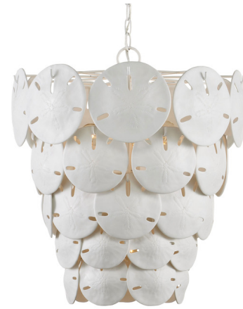
Shown in sugar white

PRODUCT DIMENSIONS . . . . . Adjustable Height: 28.5" to 96.5"