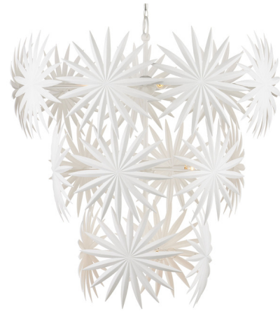
Shown in gesso white