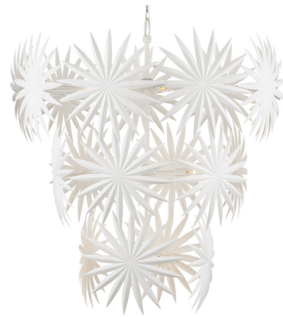
Shown in gesso white