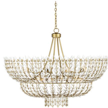
Shown in brass / white

Tom Caldwell undertook the challenge of creating a clean-lined version of a vintage design when he meticulously conceived the Magnum Opus Grande Chandelier. The rows of glass leaves attached to the three-tier arcing metal stems effervesce with light, creating a stunning sculptural fixture. The white glass also beautifully contrasts the metal in a brass finish, the cool/warm contrast bringing the gold chandelier a heightened level of texture. The beautiful white glass leaves also surround the seven bulbs on this fixture to add extra texture and nuance.