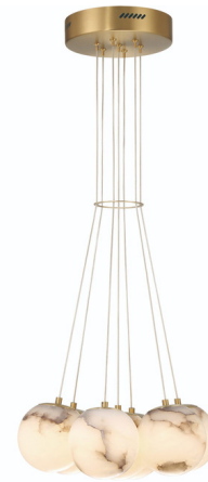
Shown in gold / white alabaster

LAMP LIFE . . . . . 20000 hours COLOR RENDERING . . . . . 90 CRI LAMP COLOR . . . . . 3000K LUMENS/WATT . . . . . 701.20 LUMINOUS FLUX . . . . . 3506 lumens