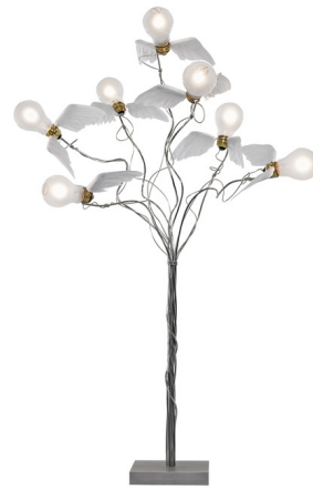
Shown in silver / white