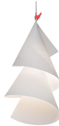
Shown in white / white