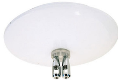
Shown in White

The Monorail 600 Watt Dual Feed (2X300W) Magnetic Surface Mount Transformer converts standard 120 volt line voltage to 12 volts to provide the necessary voltage for powering a Monorail low-voltage lighting system. Transformer mounts to a standard 4 inch ceiling junction box with round plaster ring (provided by electrician). Isolating connectors included to isolate power 2X300 watts. Dimming coil included. The shortest rigid standoff that can be used with this surface transformer is the 5 inch rigid standoff, sold separately. If dropping the rail more than 5 inches below the ceiling, order the desired rigid standoff length and two compatible power extenders. ETL listed. 9.1 inch diameter x 5.8 inch height. Finish available in Satin Nickel ONLY. Image shown in White.