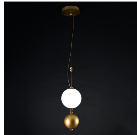
Shown in aged brass / alabaster white

LAMP LIFE . . . . . 50000 hours LAMP COLOR . . . . . 2700K Warm Dim LUMENS/WATT . . . . . 37.89 LUMINOUS FLUX . . . . . 288 lumens