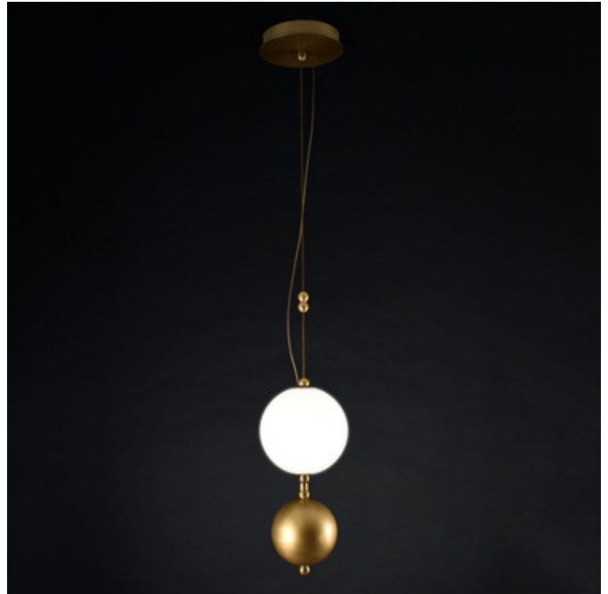
Shown in: Aged Brass / Alabaster White

The Coco XS Pendant is a tribute to Coco Chanel, who became the first woman to launch a fine jewelry collection in the 1930s. Her designs were marked by the elegant use of pearls, not only in jewelry but also as accents sewn into evening gowns. The Coco XS Pendant evokes the appearance of jewelry with its alabaster glass globe shade and metal accents for a grand, awe-inspiring look. Coco houses an integrated Dim to Warm LED (2700K to 2200K) to create the perfect ambiance in any space. Note: Cable length is not adjustable. Overall height to order, available from 27 in. (small) / 36 in. (large) minimum to 48 in maximum.