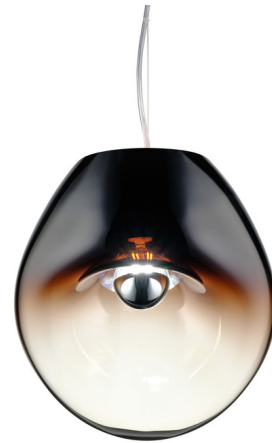
Shown in matte chrome / shaded burgundy

The Lightbody Pendant features a mouth blown and hand-crafted glass diffuser made with the 'free blow' technique where a master glassmaker blows freely without a mold, creating a unique and slightly different product each time. Each lamp has its own serial number engraved in the glass to show its authenticity.