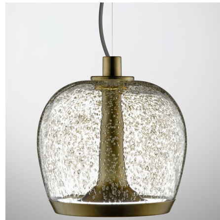
Shown in vintage brass / transparent pulegoso

The Aurelia Bold S22 Pendant features a handblown glass diffuser surrounding a metal structure that houses both direct and indirect LED light sources. Independently dimmable, the two light sources offer the possibility of single or simultaneous switching, creating direct soft light and surprising and unexpected indirect reflections. Includes canopy in matching finish and driver which fits inside junction box. 2700K color temperature includes an 11.6 watt downlight (1471 lumens) and a 5.8 watt uplight (944 lumens). 3000K color temperature includes an 11.6 watt downlight (1531 lumens) and a 5.8 watt uplight (980 lumens).