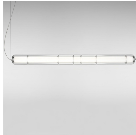
Shown in matte white / anodized aluminum / transparent

The Stacking Horizontal Pendant merges cutting edge technology and traditional glassmaking techniques. The cylinder diffuser is made out of transparent over white smooth or ribbed blown borosilicate glass with machined anodized aluminum end caps. Includes driver and Matte White canopy. Includes cover plate for US junction box. Phase cut and 0-10V dimming.