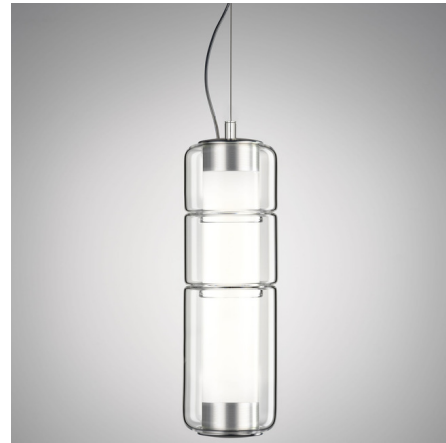
Shown in matte white / anodized aluminum / transparent

The Stacking Vertical Pendant merges cutting edge technology and traditional glassmaking techniques. The cylinder diffuser is made out of transparent over white smooth or ribbed blown borosilicate glass with machined anodized aluminum end caps. Includes driver and Matte White canopy. Phase cut and 0-10V dimming.