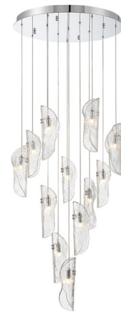
Shown in chrome / clear

PRODUCT DIMENSIONS . . . . . Adjustable Cable Lengths: 96" LAMP LIFE . . . . . 10000 hours COLOR RENDERING . . . . . 90 CRI LAMP COLOR . . . . . 3000K LUMENS/WATT . . . . . 1,150.00 LUMINOUS FLUX . . . . . 3450 lumens