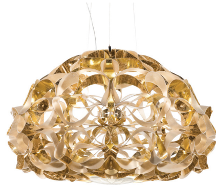
Shown in gold

The Quantica Pendant possesses a seemingly chaotic but symmetrical form composed of scrolling strips of Opalflex techno-polymer. Quantica was inspired by the idea of quantum entanglement, a concept in physics used to describe interconnected relationship of atoms across great distances. The pendant's winding structure is complemented by a gold foil finish to produce an elegant sparkle.