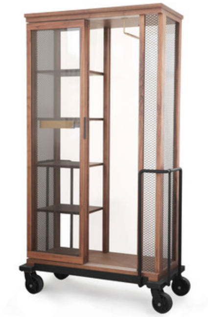
Shown in: Black / Natural Walnut

The Cabinet of Curiosity Read is a stylish wooden and glass wardrobe set atop a steel cart with casters. The cart was inspired by the trolleys used in ceramics factories to load large kilns. This industrial accent is echoed in the metal mesh over the cabinet's glass side panels. The Cabinet of Curiosity's unique blend of decorative influences makes it a versatile addition to any interior.