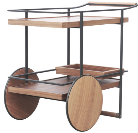
Shown in black / natural walnut

The James Bar Cart is both bold and defined while at the same time light and elegant. James has been designed with negative space in mind with its sleek powder-coated steel frame creating definitive lines while maintaining an airy, open expression.