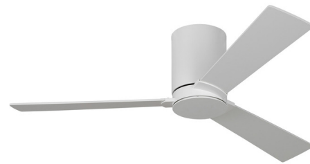
Shown in matte white / matte white / matte white