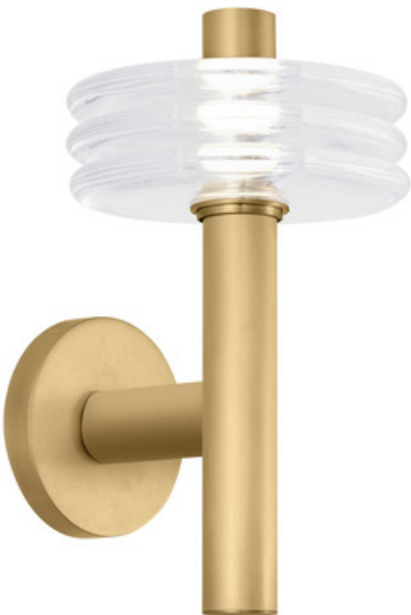
Shown in: Natural Brass / Clear

The Laurel Wall Sconce combines elegance and craftsmanship in its unique design of stacked disks set on a bold metal arm. Made of glass casted in Italy, the disks bring movement and dimension into your space as LED light shines from within. Place this sconce in a living room or hallway to add ambient illumination with just the right touch of sophistication. A 120-277V universal driver is included, dimmable with a TRIAC, ELV, or 0-10V dimmer. The Natural Brass is a living finish that will patina over time. If it becomes uneven or spotty, a brass cleaner can restore the finish.