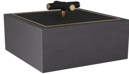
Shown in black / brass

The Xander Box is a stylish storage accessory with a luxe aesthetic. The wooden box is complemented by an inset brass bezel for an understated accent. A leather-wrapped, cross-shaped handle completes the look and provides easy opening.