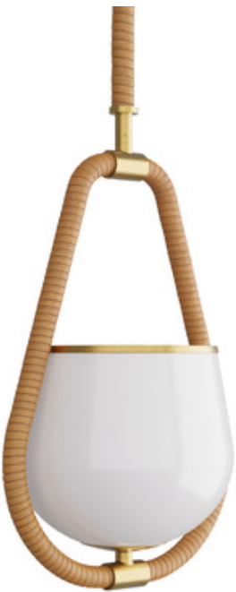
Shown in: Antique Brass / Opal

The silhouette of the Arlie Pendant was inspired by the shape of an equestrian stirrup. The pendant's frame is wrapped with leather and supports a cup-shaped glass shade. Whether displayed on its own or in a grouping of multiple pendants, Arlie will add the warm touch of natural materials to any interior.