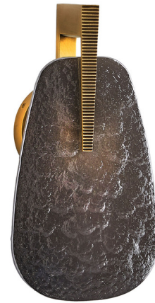
Shown in antique brass / smoke luster

COLOR RENDERING . . . . . 90 CRI LAMP COLOR . . . . . 2700K LUMENS/WATT . . . . . 36.67 LUMINOUS FLUX . . . . . 110 lumens