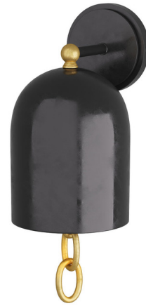
Shown in bronze

The Antoni Wall Sconce offers an elevated take on a classic bell-shaped wall sconce by adding a decorative brass chain. The chain adds a touch of sparkle to contrast the sconce's sleek bronze frame.