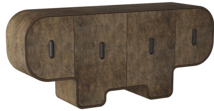
Shown in tortoise burl / bronze

The Bruno Credenza will provide a visual centerpiece in any interior with its unique silhouette and stunning tortoise burl oak veneer. Bruno's oblong body is supported by a pair of hollow legs which seamlessly blend into the design to provide additional storage space. Four bronzed iron handles provide a visual accent and echo the curved lines seen throughout the design.