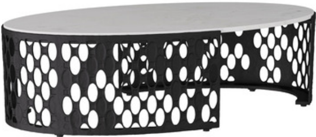
Shown in: Blackened Iron / White Marble

The Onze Coffee Table features an oval marble tabletop supported by a perforated iron base for a substantial look that will elevate the decor of any space. While the base recalls the wrought iron metalwork of the 19th century industrial era, its streamlined silhouette is distinctly modern.