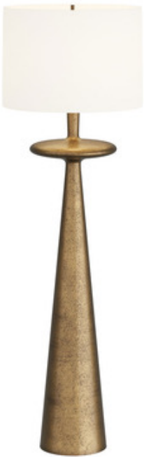
Shown in: Antique Brass / Off White

The Putney Floor Lamp's silhouette reveals three stacked rounded forms, a cylinder, a disk, and an elongated tapered cone base showcasing angular composition and balance. The midcentury feel of the Putney's bold form is topped with an Off-White linen shade, making this lamp a perfect fit for a modern living area. 3-way rotary switch located on the lamp's neck.