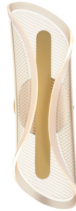
Shown in gold / frosted

LAMP LIFE . . . . . 30000 hours COLOR RENDERING . . . . . 90 CRI LAMP COLOR . . . . . 3000K LUMENS/WATT . . . . . 58.33 LUMINOUS FLUX . . . . . 700 lumens