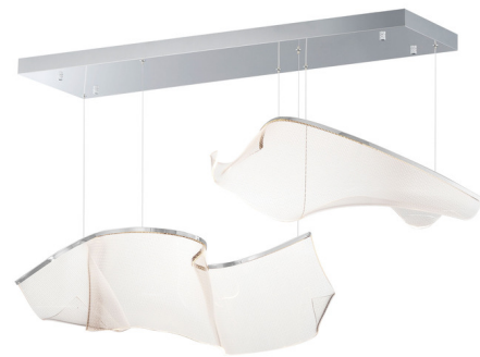
Shown in polished chrome / clear patterned acrylic

PRODUCT DIMENSIONS . . . . . Min/Max Overall Height: 15.75-133" LAMP LIFE . . . . . 25000 hours COLOR RENDERING . . . . . 90 CRI LAMP COLOR . . . . . 3000K LUMENS/WATT . . . . . 45.24 LUMINOUS FLUX . . . . . 950 lumens