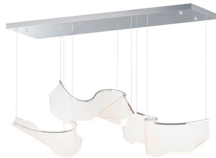
Shown in polished chrome / clear patterned acrylic

LAMP LIFE . . . . . 25000 hours COLOR RENDERING . . . . . 90 CRI LAMP COLOR . . . . . 3000K LUMENS/WATT . . . . . 45.45 LUMINOUS FLUX . . . . . 1500 lumens