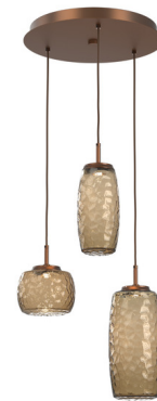
Shown in burnished bronze / vessel bronze

The Vessel Round Multi Light Pendant brings a clean fusion of a geometric form and organic design to your interior space. Three sizes of decorative glass diffusers cast a captivating play of light shadows across your room. Cables are adjustable during installation to create your own unique look. Note: Due to the weight of the 8 light and 11 light fixtures, additional ceiling support is required.