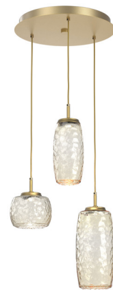
Shown in gilded brass / vessel amber

The Vessel Round Multi Light Pendant brings a clean fusion of a geometric form and organic design to your interior space. Three sizes of decorative glass diffusers cast a captivating play of light shadows across your room. Cables are adjustable during installation to create your own unique look. Note: Due to the weight of the 8 light and 11 light fixtures, additional ceiling support is required.