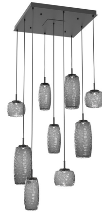
Shown in matte black / vessel smoke

The Vessel Square Multi Light Pendant brings a clean fusion of a geometric form and organic design to your interior space. Three sizes of decorative glass diffusers cast a captivating play of light shadows across your room. Note: Due to the weight of this fixture, additional ceiling support is required.