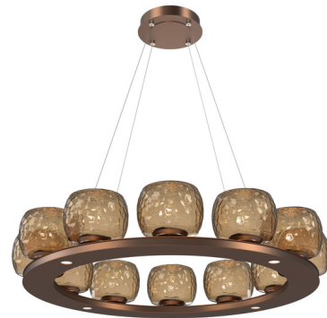
Shown in burnished bronze / vessel bronze

The Vessel Ring Chandelier brings a clean fusion of a geometric form and organic design to your interior space. The smooth frame holds decorative glass diffusers and casts a captivating play of light shadows across your room. Note: Due to the weight of this fixture, additional ceiling support is required.