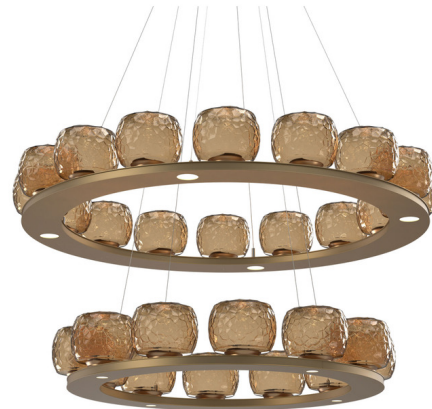
Shown in novel brass / vessel bronze

The Vessel Two Tier Chandelier brings a clean fusion of a geometric form and organic design to your interior space. The smooth dual frame holds decorative glass diffusers and casts a captivating play of light shadows across your room. Adjustable cables allow you to place the rings to your desired look. Note: Due to the weight of this fixture, additional ceiling support is required.