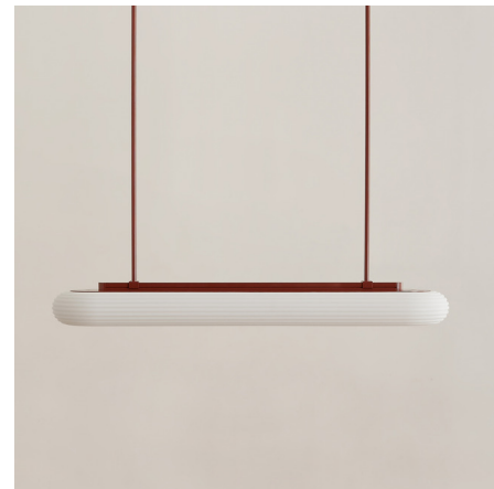
Shown in brick / white

PRODUCT DIMENSIONS . . . . . Min - Max OAH: 15in - 82.5in LAMP LIFE . . . . . 50000 hours COLOR RENDERING . . . . . 95 CRI LAMP COLOR . . . . . Warm Dim LUMENS/WATT . . . . . 71.27 LUMINOUS FLUX . . . . . 3578 lumens