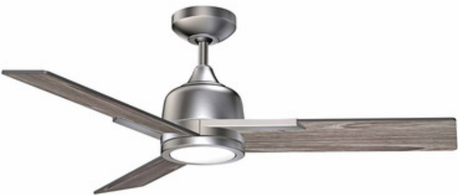
Shown in: Satin Nickel / Vintage Oak

The exceptional Triton Ceiling Fan with Light not only ensures optimal air circulation but also adds a stylish touch to your space, delivering both comfort and elegance. With its tri-blade design, it guarantees powerful airflow, and an integrated LED light kit provides ambient illumination to create a comfortable environment. A battery-operated wall control is included and enables motor on/off, 3 speeds, light on/off and dimming. Reverse can be set using a switch on the fan. Note: Some finishes are not available in all sizes.