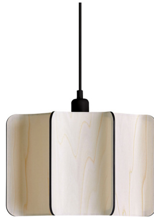
Shown in black / ivory white

The Kactos Pendant brings a tactile, nature inspired look to your interior space. The lamp holder has a matching cord and canopy and holds a cactus shaped wood veneer shade, arranged in a vertical concave fashion held by an acrylic frame. The result is beautiful warm light reflected across your room. Includes canopy mounting plate to cover standard US junction box.