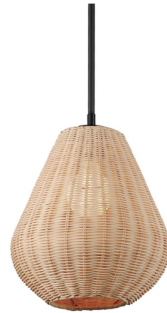
Shown in black / natural

LAMP LIFE . . . . . 25000 hours COLOR RENDERING . . . . . 90 CRI LAMP COLOR . . . . . 3000K LUMENS/WATT . . . . . 45.00 LUMINOUS FLUX . . . . . 270 lumens