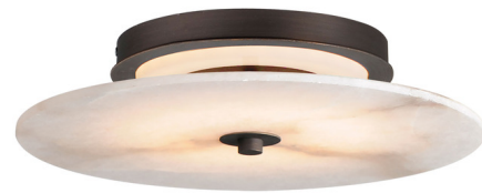
Shown in dark bronze / alabaster

Modern in execution, yet representative of the classic inverted bowl pendants, the Quarry Wall/ Flush Mount Ceiling Light features natural Spanish alabaster in an iron frame finished in Darkened Bronze. An inverted bowl form is created using the alabaster's straight line and the empty space below it. Slim housings of LED direct light both up at the alabaster to highlight the stone's character and another direct light downward for functional use below. Can be mounted as a ceiling light or wall sconce. Dimmable via Triac dimming.