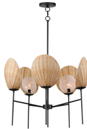
Shown in black / natural

A classical chandelier that transports you to a tropical paradise, the Maldives Chandelier features hand woven wicker shades that elegantly curve around precisely cut opal white glass. Suspended on slender supports of steel finished in Matte Black, the handcrafted shade structures conjure up images of bungalows along the coast.