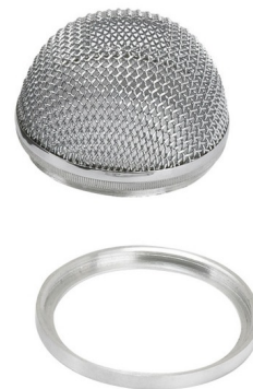
Shown in aluminum

Mesh Backlight Shield MR16 accessory available in Aluminum, Black or Antique Bronze. Includes louver lens holder and holds up to two lenses or louvers, sold separately. One 12 volt MR16 halogen lamp of up to 75 watts is required, but not included.