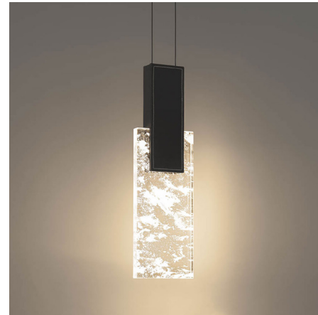
Shown in black / optic haze quartz

The Tryst CCT Pendant brings an elegant simplicity to your interior space. The leather wrapped frame holds a panel of optic haze quartz that casts a sparkling shadows across your room. May be installed on a sloped ceiling. Color temperature adjustability switch from 3000K/3500K/4000K at time of installation can be installed in the junction box. Driver concealed within the canopy.