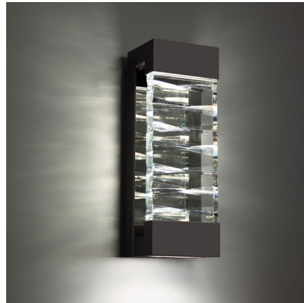
Shown in black / crystal

The Labrynth CCT Outdoor Wall Sconce brings an elegant beauty to your exterior space. The sleek metal frame holds playful cuts of luxurious crystals that casts warm shadows across your area. Driver is concealed in the backplate. Specifically formulated using powder coat to resist UV and costal environmental conditions, providing a long-lasting finish with premium 316 Marine mirror grade stainless steel plate and hardware. Color temperature adjustability switch from 3000K/3500K/4000K at time of installation.