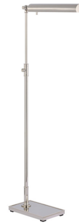
Shown in polished nickel