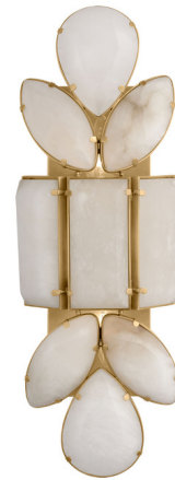
Shown in soft brass / alabaster

The Lloyd Alabaster Wall Sconce glams up your space with its sparkling array of large faceted Alabaster pieces, creating an enchanting play of light and shadows across your room. May be mounted horizontally or vertically.