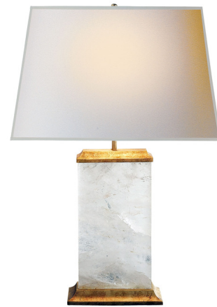
Shown in natural quartz / gold leaf / linen

The Crescent Table Lamp adds a bold look of contemporary nature to your interior space. The natural quartz body is topped by a rectangular linen shade. Dual pull chain operation on the lamp socket for independent lamp operation.