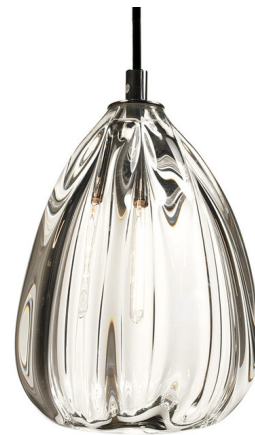
Shown in black / clear

COLOR RENDERING . . . . . 90 CRI LAMP COLOR . . . . . 2700K LUMENS/WATT . . . . . 87.50 LUMINOUS FLUX . . . . . 350 lumens