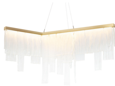
Shown in satin brass / wavy kiln glass

The Cascata Chandelier is a uniquely sculptural fixture thanks to its triangular frame and cascading sheets of wavy kiln glass. The chandelier's arms house an integrated LED light source which shines downwards through the undulating glass to create a dazzling display. Cascata can be displayed over a round or square dining table or installed in a stairway or atrium to showcase its triangular frame from all angles. Available with Ceiling Rose canopy (with LED driver inside) or flush Mounting Plate (with remote LED driver). Note: Due to the weight of the fixture, additional ceiling support is required.