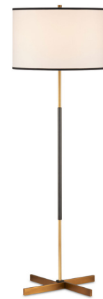
Shown in brass / bronze / off white

PRODUCT DIMENSIONS . . . . . Shade Dimensions: 14" x 22" x 22"