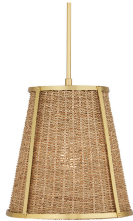
Shown in polished brass / natural

The Deauville Pendant was created by Suzanne Duin, who is known for a keen eye in sourcing authentic French antiques and home accessories from around the globe. Each piece in her line of woven light fixtures is handmade by artisans in Southeast Asia; the Deauville an example in natural seagrass and steel in a polished brass finish. This tailored pendant trimmed in gold brings both texture and French flair.