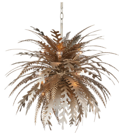
Shown in contemporary silver leaf

PRODUCT DIMENSIONS . . . . . Rods Included: (6) 12".